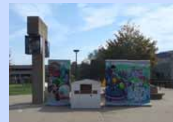
Replica of the Berlin Wall and Checkpoint Charlie on the NKU campus

Further information about Projekt Mauer can be found on the official website . Additional pictures, including more from Colonel Halvorsen's visit to the museum, are available here .